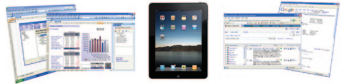
Figure 2: Reports can be accessed online or on the go with the Apple iPad.

Customers want to put information in the hands of a broad range of users and bring it into familiar working environments they use each day, which helps to increase the adoption of BI in the organization. It is also important to ensure no duplication of work is needed to use the many delivery models.