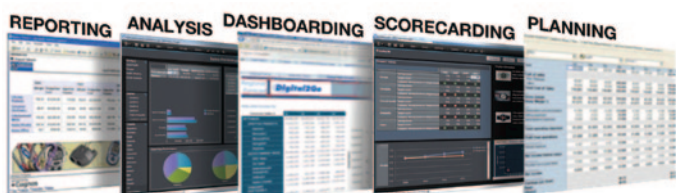
Figure 1: A comprehensive portfolio of integrated solutions to manage business performance

IBM Cognos solutions are based on conversations with hundreds of successful midsize customers that have made BI a reality in their organizations. These conversations have identified six strategies that the companies have in common. Overall, these strategies address both business and IT challenges.